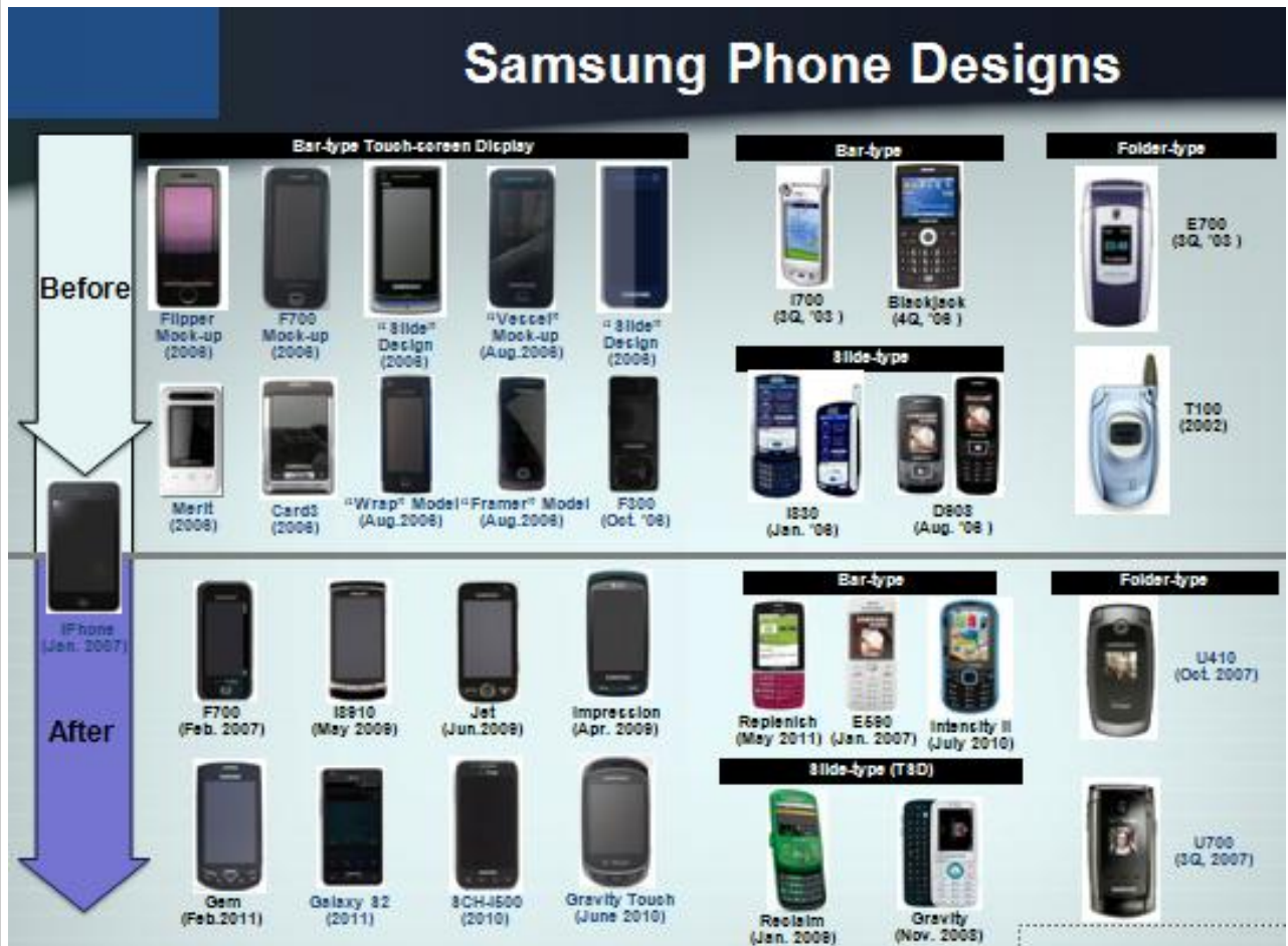
Ex. 9 (DX 684).

In contrast, Apple's supposed proof of copying consists of competitive benchmarking and analysis documents created by Samsung. Apple itself, however, regularly conducts the same types of detailed competitor analyses that it now contends proves copying. For example, Apple conducted tear-downs of Samsung products—such as the Vibrant, Galaxy Tab 10.1, Juke, and YP-R1 MP3 player—to analyze [REDACTED]